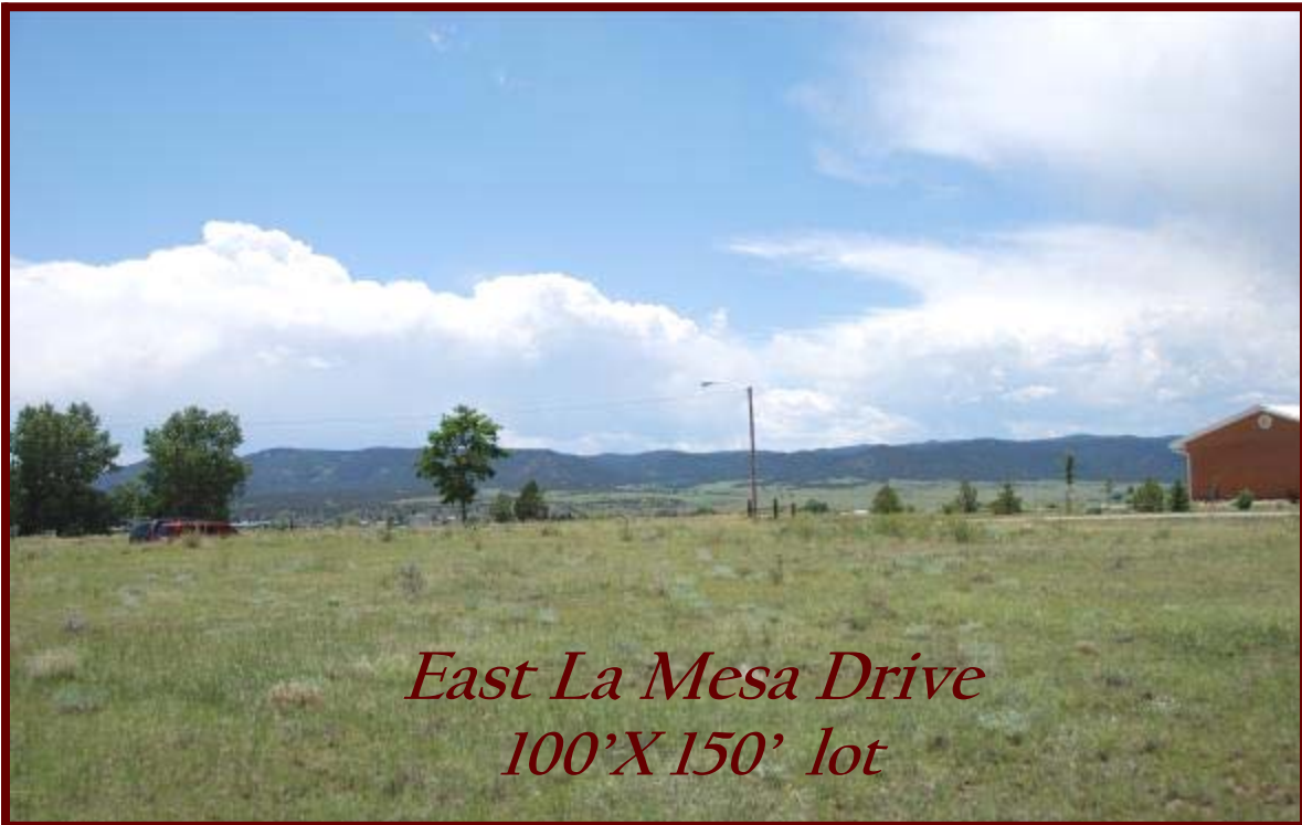
East La Mesa Drive 100' X 150' lot

"Making a difference to the land and the people"