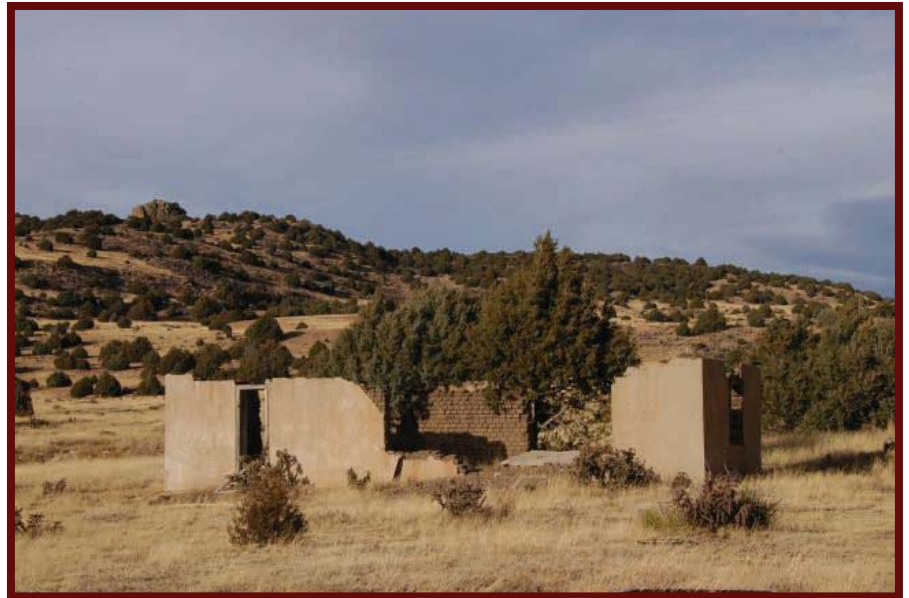
Remains of Homesteader's Adobe Home