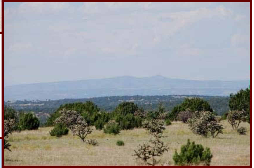
Excellent building sites with views, abutted by county roads on 3 sides and access to power.