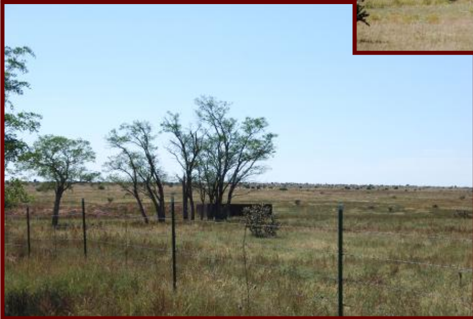
Grazing land with excellent fences and a 40' x 60' hay barn