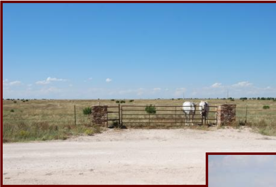
220 acres of rolling prairie with cedar breaks looking over the Canadian River Canyons...